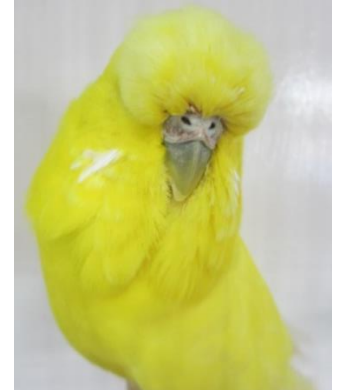
Best Spangle Double Factor