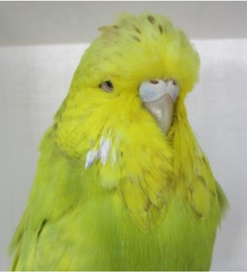
Best Spangle AOSV