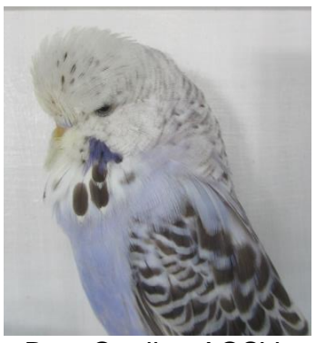
Best Opaline AOSV