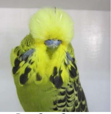
Best Grey Green